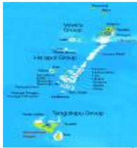
Map of the kingdom of Tonga